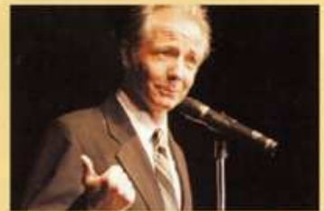
THE COMEDY SHOP RIVER PALMS