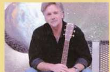
LOCAL MUSIC SCENE AROUND THE AREA