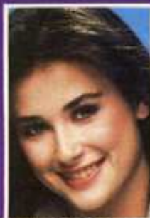
RICK SPRINGFIELD DEMI MOORE