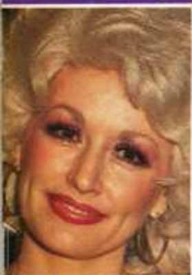
DOLLY PARTON She (knows—Where There's Smoke There's Fire!