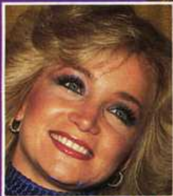
BARBARA MANDRELL Sexy Enough To Rope Mr. Right—Forever!