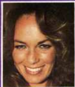
CATHY BACH They Call Her A Heartbreaker— Then Come Back For More!